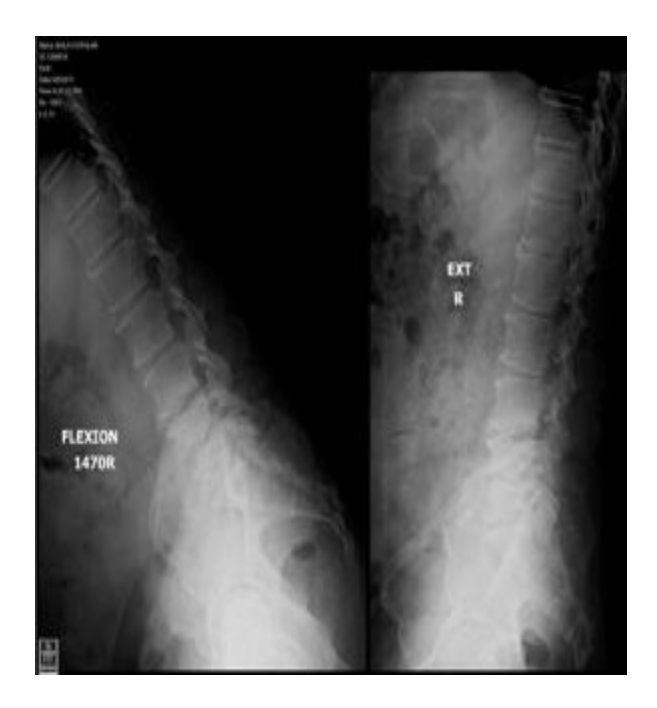
Fig.3 Post operative dynamic X ray LS spine showing no instability