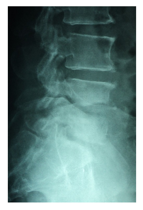
Fig.1 Pre-operative X-Ray LS spine (lateral) showing end plate changes and vertebral involvement L4-S1

MRI LS spine confirmed the diagnosis with more than 3 level involvement, epidural and peri vertebral collection (Fig.2). Presence of active infection restricted the use of any instrumentation for spinal stabilization and he was subjected to wound debridement only. Debridement was done twice microscopically with minimally invasive approach. Both pus culture and blood culture grew extended spectrum beta lactamase producing E coli (ESBL E coli). He was given IV antibiotics as per culture sensitivity reports for a total duration of 6 weeks. With appropriate antibiotics his clinical symptoms improved and now 2 years post procedure, all clinical and laboratory manifestations related to the discitis were found to be resolved and he is able to perform all the routine activities. Flexion extension and X ray (Fig.3) reveal no instability of spine.